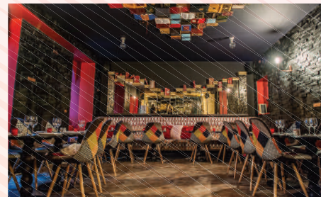
Cheers! Maria Magdalena 41 Rue de la Rochefoucauld, 75009 Paris

INSIDER TIP Real crush for their truffle Burratina!