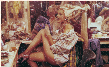
"Les nuits parisiennes" Hôtel de ville 4 rue de Lobau, 75004 Paris

This exhibition is an invitation to travel into the heart of the city by night, from the 18th century to the present day with more than 300 paintings, photos, sets and films. Through the way men and women live, work, dance, meet ... night brings a new light on the political, cultural, aesthetic evolution of Paris. Open from Monday to Saturday, 10 AM to 6.30 PM.