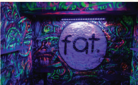
Street bar Fat bar 8 rue de Beauce, 75003 Paris

This exhibition is an invitation to travel into the heart of the city by night, from the 18th century to the present day with more than 300 paintings, photos, sets and films. Through the way men and women live, work, dance, meet ... night brings a new light on the political, cultural, aesthetic evolution of Paris. Open from Monday to Saturday, 10 AM to 6.30 PM.